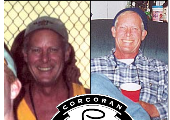
JC Saints Outing August 2002